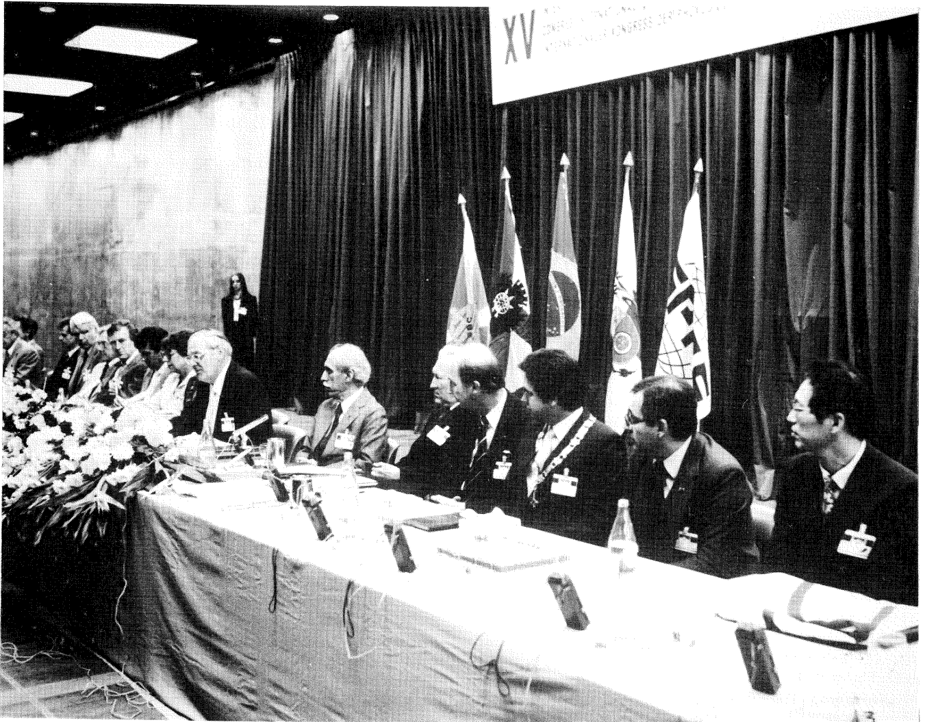
The main table at the Closing Ceremony

The Congress Director thanked everyone present in this ceremony and declared the Congress closed.