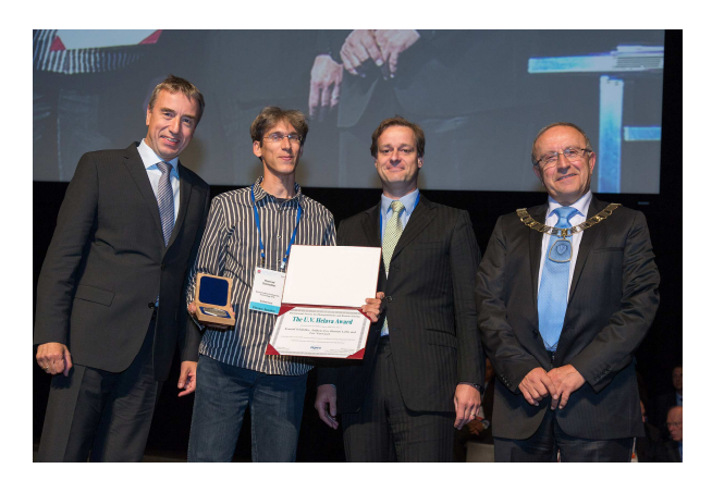
Konrad Schindler receiving the U.V. Helava Award

The jury stated that the paper presents a sophisticated system to detect and track pedestrians from moving vehicles. It combines close-range photogrammetry of dynamic scenes and automatic image understanding. The topic is highly relevant for ground based navigation systems. The objective, namely to have a real time interpretation system, is challenging. The paper gives insight into the different modules and presents an impressive quantitative evaluation. It is well organized, interesting, and easy to read.