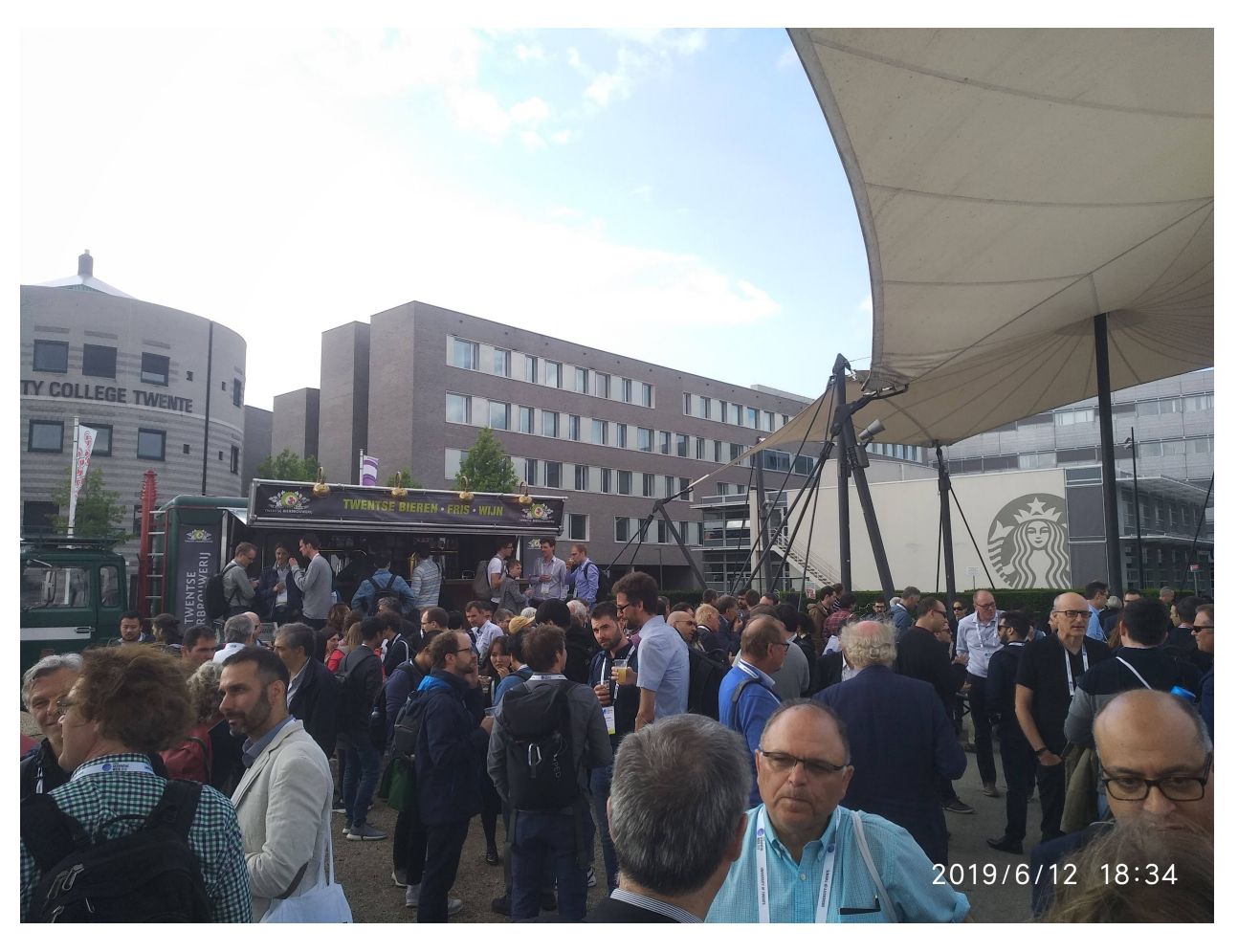
Gathering after conference. Social gethering after a busy day in conference.