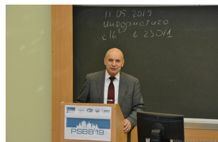
(b) Welcome from MSU