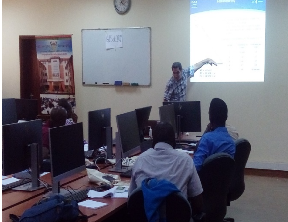
Plate 1: Some of the moments during the summer school

The third day was a continuation of the second day with participants extracting ground deformation from SAR data and interpreting the interferograms generated.