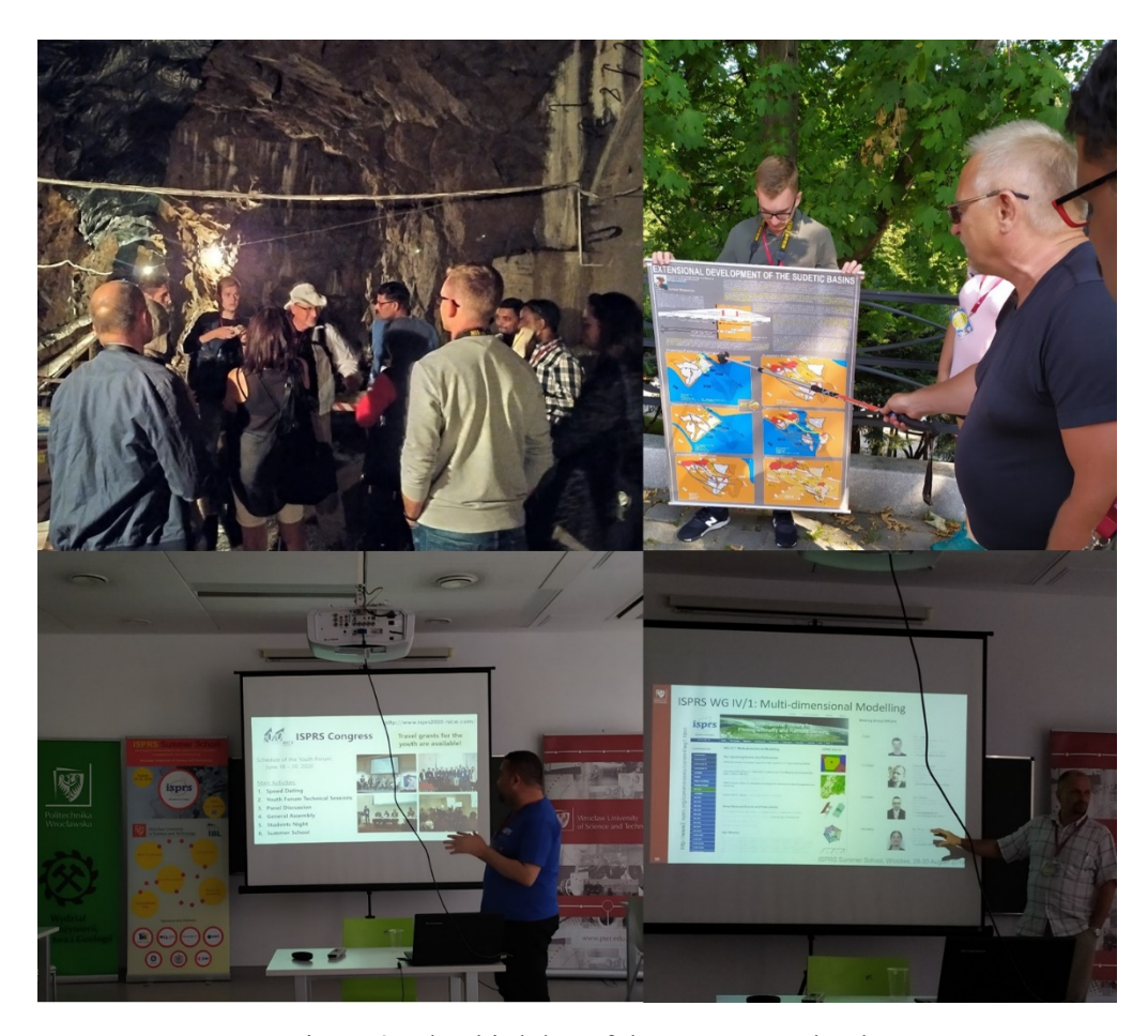
Figure 3: The third day of the Summer School