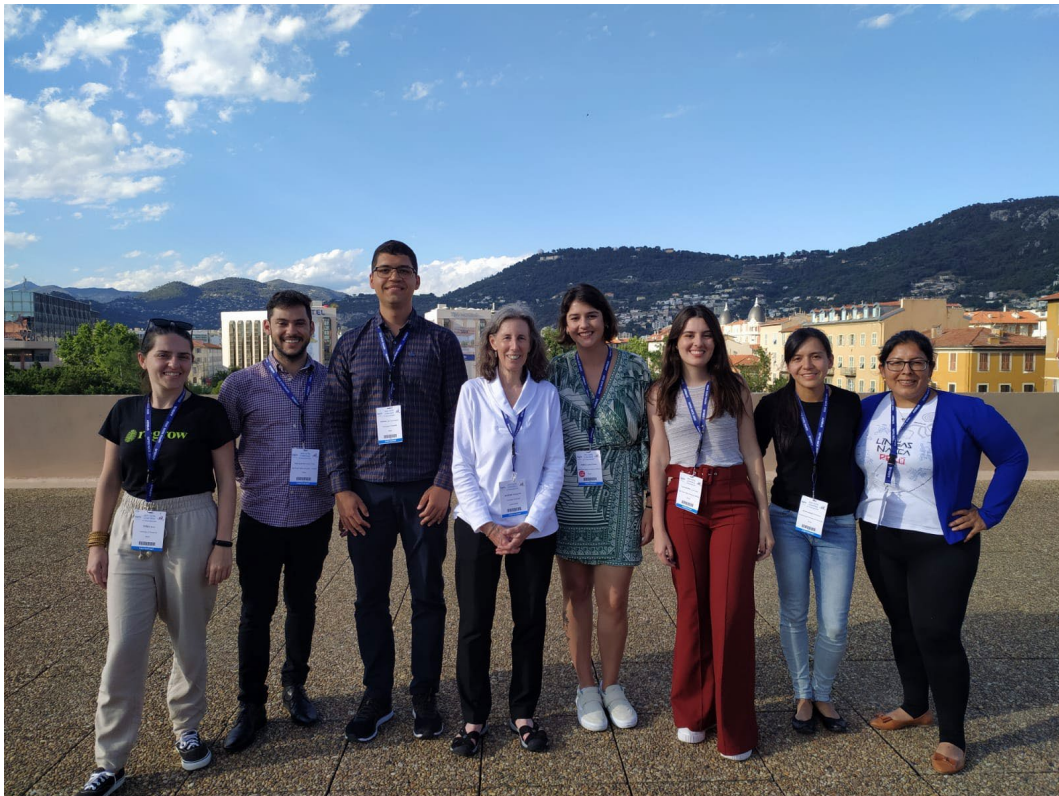
Figure 3 - Latin American researchers at the ISPRS Foundation meeting.