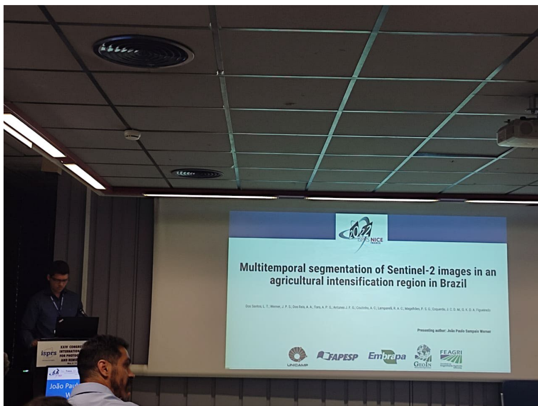
Figure 1 - My presentation of the work done by our research group at the University of Campinas, Brazil. Title: "Multitemporal segmentation of Sentinel-2 images in an agricultural intensification region in Brazil".

I consider the week I was in Nice participating in the congress a great learning period. I will keep the memories of seeing young researchers and widely recognized researchers discussing and doing science together at a conference. For all these experiences, I am grateful to the ISPRS Foundation for making it possible for me to participate in the conference by awarding the travel grant.