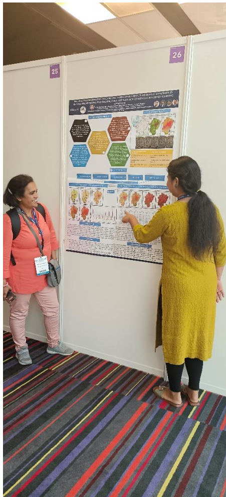
Presenting my Poster