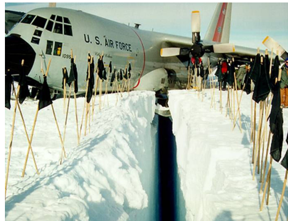
Fig 3. Avoidance of unsafe landings during deep field landings on the Antarctic continent has high operational value and the associated technology is also capable of generating valuable scientific data.

One of the first applications chosen for investigation of the utility of the SABIR arm concept is focused on the provision of a crevasse detection radar system for use during deep field skied LC-130 aircraft operations.