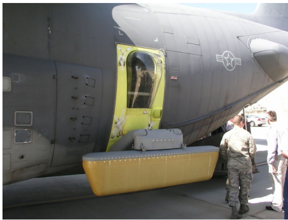
Fig 2. Installation of a SABIR R system specialized mission mounting system allows integration of sensors and instrumentation to be installed in existing aircraft doors without permanent modification to the host aircraft.

opportunities, the topic has been revisited. The skied landing capability of the existing LC-130 aircraft is considered to be the ideal platform. It is noted that other research aircraft platforms would require significant staging and deep field support for their effective use. The LC-130 aircraft have the advantage that they are all ready on site and supported on continent, and have proven themselves capable of travelling anywhere in Antarctica. The only negative to their use for research purposes centers on the extensive effort and operational coordination required to modify the aircraft to the kinds of configurations usually requested by researchers. A solution that minimized the impact on the LC-130 airframe, and would greatly simplify the integration of research projects was sought.