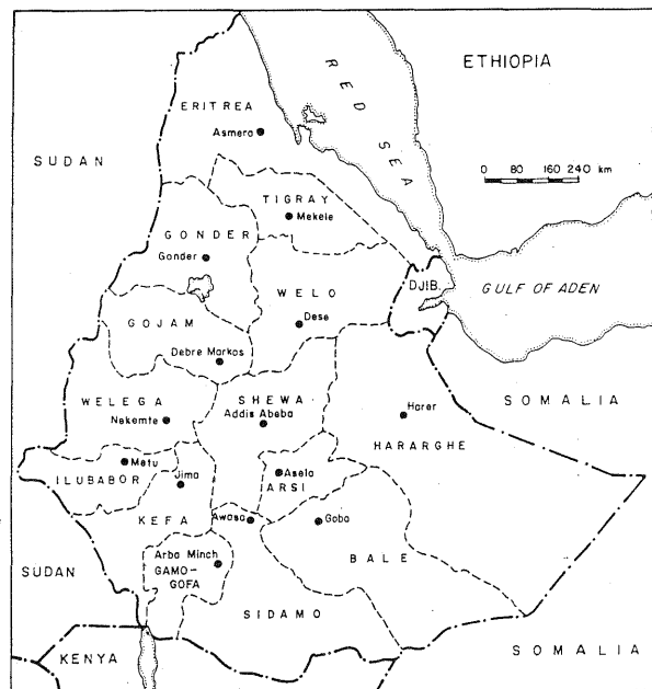
Fig. 1 Map of the Regions of Ethiopia

The available mean August (1984) rainfalls, for the Abyssinian Highland, were found to be 44 mm and 164 mm for Kombolcha (in Welo region) and Debre Markos (in Gojam region), respectively (henricksen, 1986).