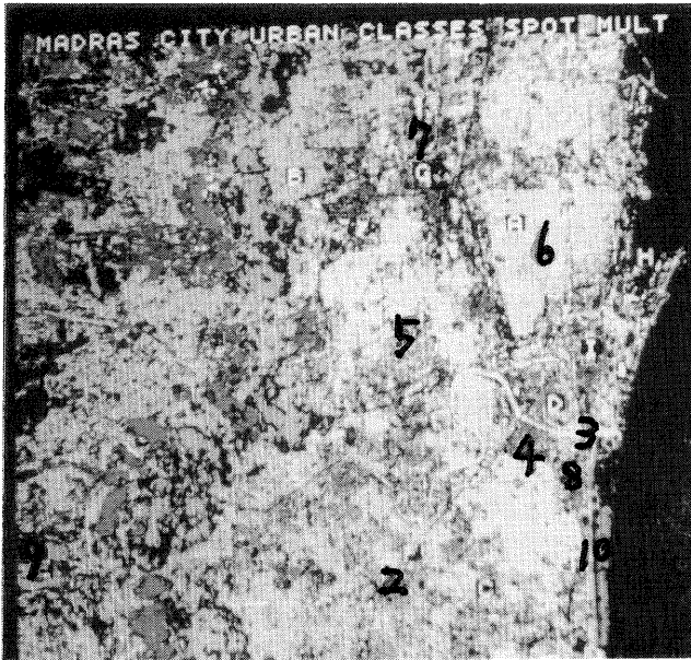
Fig.1 Original.(MADRAS CITY)