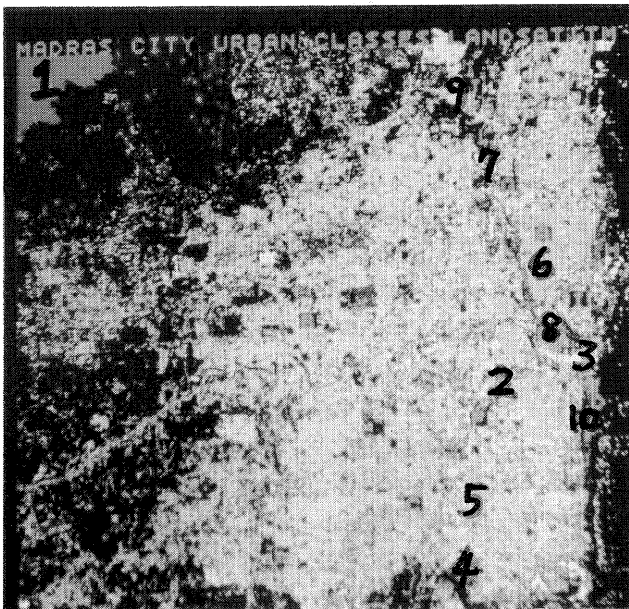
Fig.3 Original(MADRAS CITY)