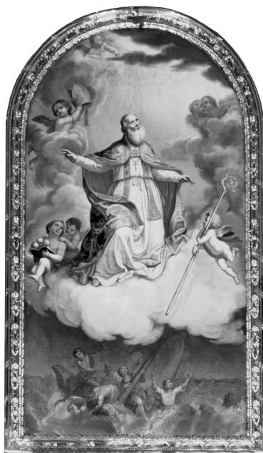
Figure 4. Orthophoto of a fresco in the Dome