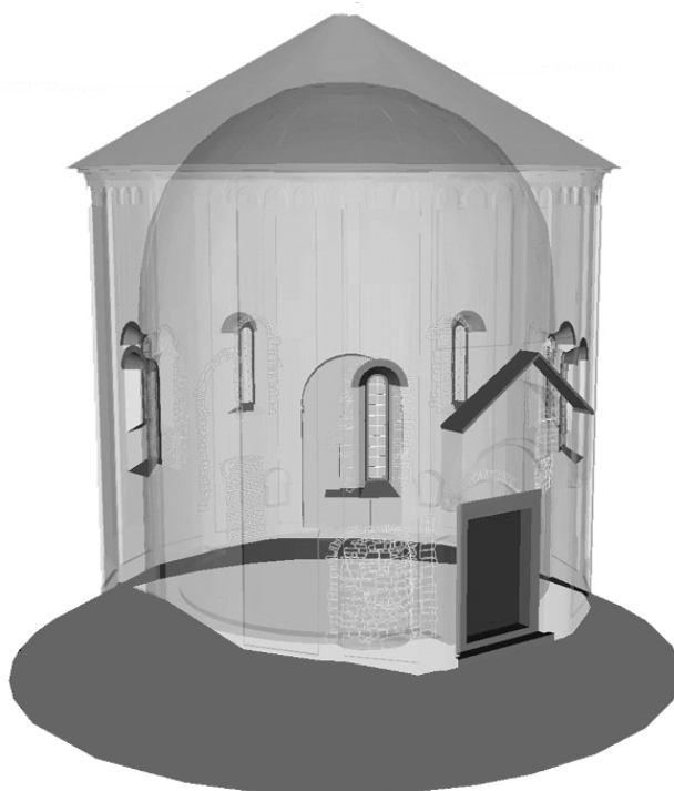
Figure 5. A 3D model of Rotunda Carmine in Koper

The central building, now known as the Rotunda of Our Lady of Mount Carmel or the Carmine Rotunda, stands on the northern side of the Cathedral of Koper. The building ranks as one of the town's oldest architectural monuments, since it was once a part of a former Romanesque church complex, which included a basilica with a crypt and baptistery. For restoration purposes, a detailed photogrammetric survey of the exterior as well as the interior of the building has been produced (Figure 5). The responsible conservator collected data on the phases of construction and on the historical development of the building, and a virtual model of the development of the monument in four stylistic periods (Romanesque, Gothic, Baroque and Forlati's presentation) has been produced as well.