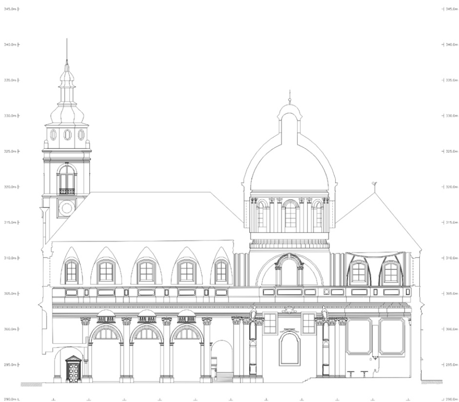
Figure 3. Vector map of a cross section of the Dome