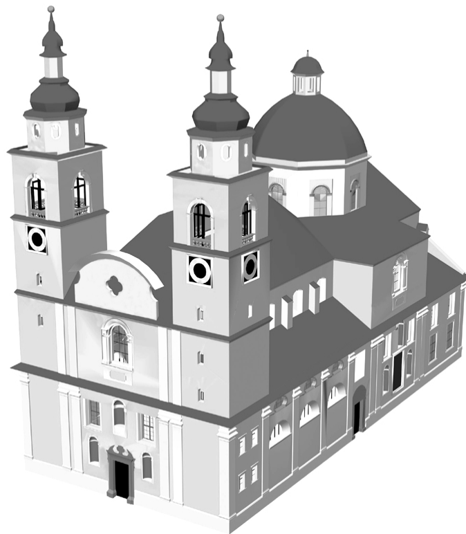
Figure 2. A 3D model of the Dome of Ljubljana