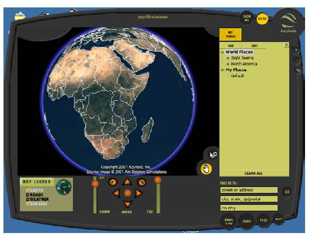
Figure 1. First international debut of 3-D Geobrowser.

In November of 2001, at the 5<sup>th</sup> African GIS Conference in Nairobi, Kenya, the United Nations Environment Programme contracted with one of the leading Geobrowser developers, Keyhole Technology, Inc. to provide the first international display of an operational Geobrowser. This system streamed data from globally distributed servers to provide a stunning display of global satellite coverage of the Earth's surface including the overlay of database resources upon the spherical tessellation of a virtual globe, Figure 1. As the audience included government and industry leaders from around the globe, the impact of this milestone presentation cannot be overstated.