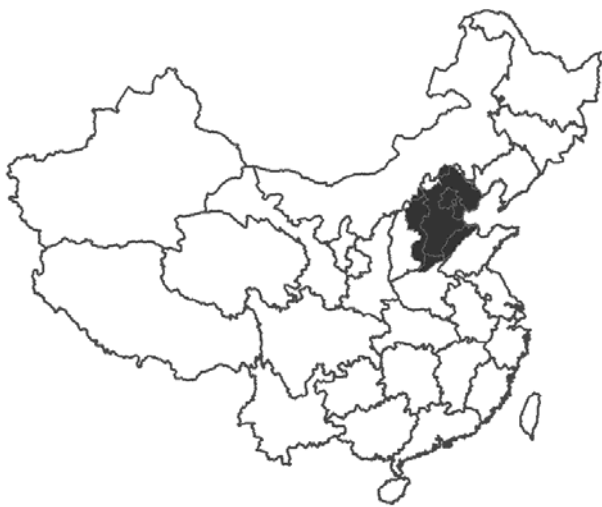
Figure 1. The location of Haihe River Basin in mainland China

Accompanied with significant economic growth in the last decade, HRB experienced a series of great changes in land use and land cover during this period due to intensive human-induced activities, including intensive exploitation of land resources. So the matter of evaluating the eco-environment and keeping sound circles in HRB is crucial in order to achieve the sustainable development of basin's society and economy.