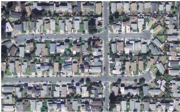
Figure 1. Aerial photograph of the study area (color image with 0.3 meter spatial resolution)

The high resolution remote sensing data used in this research are from aerial photos with 0.3 meter spatial resolution. The study area is located in Oakland, California (Figure 1).