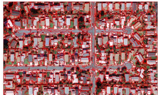
Figure 2. The result of image segmentation

Where, S_k is mean difference to the band k ; m is the number of pixels of the whole scene. Similarly, there are three features which exist in the mean difference to the scene.