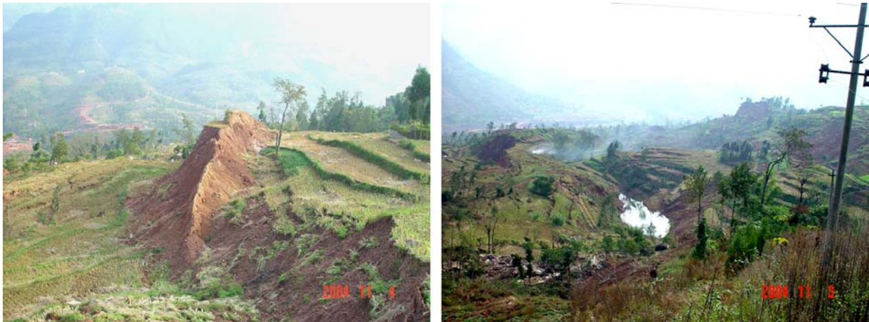
Figure 2. The scenic of soil-ridge and tensile fracturing scarps on Tiantai landslide