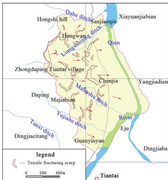
Figure.3. The plot of tensile fracturing minor scarps on Tiantai landslide

4.3.2 The slip distance of landslide: According to connected length of the twin characteristic dot of landslide, we can calculate the slip distance of different slide body. The front middle sliding body is comparative large, between 200 to 240m, the middle sliding body is 100 to 160m and the back part is less than 40m (Figure 4).