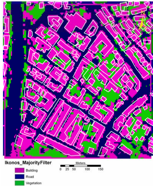
Figure 3. Majority Filter applied of MLC of Ikonos