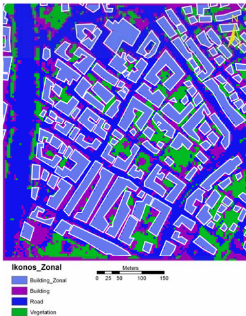
Figure 5. Zonal Statistics applied of MLC of Ikonos

The second step of the study is zonal based classification procedure. For that procedure image data are segmented into building and non-building areas then zonal statistics that calculates the statistics on values of a raster within the zones of building polygons is performed then each object assigned to building class. The result of this analysis is given in figure 5 and 6. According to generated results building pixel percentages compared to whole images of Ikonos and QuickBird are 33.6% and 33.8% respectively (Table 5-6).