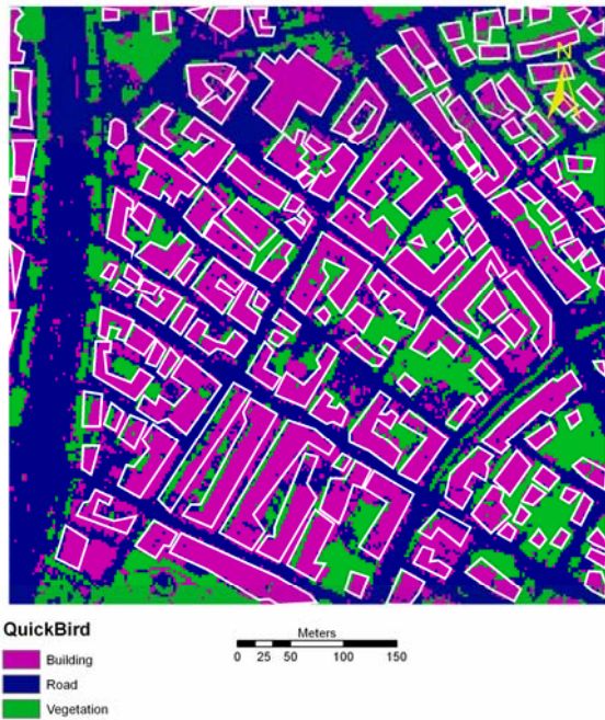
Figure 2. MLC of QuickBird