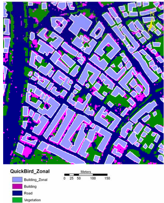
Figure 6. Zonal Statistics applied of MLC of QuickBird