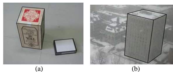
Figure 2. (a) Two boxes with digitized edges superimposed (b) Burnside Hall with digitized edges superimposed

The building in Figure2b is an irregular cube but we use a rectilinear building model to approximate it, which induces measurement errors, especially in the corners of the building. Besides, the occlusions caused by snow make the accurate measurement of the building top and bottom difficult. Under all of this noise, however, we still achieve reasonable results using model based approach. The computed dimensions of Burnside Hall are 35.44, 34.92, and 53.33 meters respectively, as compared to the model dimensions obtained from DWG file of 35.44, 32.42, 50.00 meters. While the vanishing points based