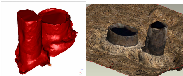
Figure 6. The forge: left as a smoothed 3-D model; right as a 3-D coloured model

work would include some views and horizontal cuts from the interesting object. For a conventional, archaeological capture (outlines by hand, views) there was not enough time at this building site. With the help of the scan data many standard products (e.g. plans in full scale) can be produced.