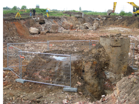
Figure 5. Forge and building site

Because of early investigations in the Krupp archive (one of the most important and biggest industrial archives in the world) it was expected that at that place a forge could be found. The whole area around the forge was categorised as archaeologically relevant so that a spontaneous measurement campaign was possible because of a good coordination in the run-up. When the forge was in fact found in the building site in Essen it was captured by laser scanning (Imager 5006 by Zoller + Fröhlich; Germany) and some photos. In six hours fourteen different scan positions were used to capture the forge and the topography around it as, for example, walls and fundaments. An area of about 20 by 30 metres was scanned. Additional GPS measurements were necessary for positioning the point cloud into the Gauss-Krueger coordinate system. After the local measurement the forge (diameter about 3 metres, figure 5) was demolished because a construction road was built there.