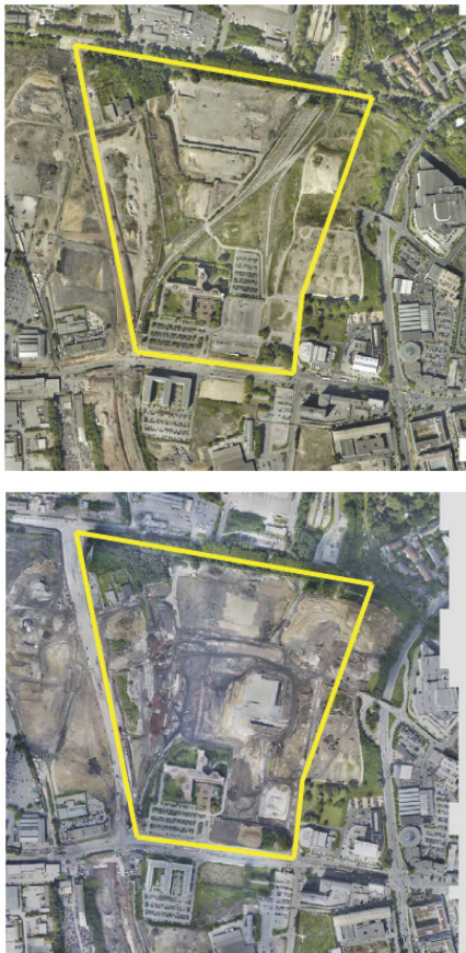
Figure 3. Aerial photograph of “ThyssenKrupp Quarters”, above from 2 nd May 2007, below from 23 rd August 2007

In 60 days of work – between the two aerial photographs – the situation has changed completely: On average, 4000 cubic metres of soil were moved each day, all together about 240.000 cubic metres.