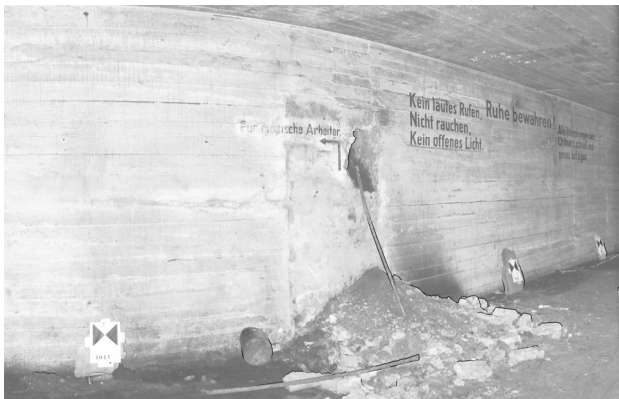
Figure 7. Screenshot of a scan

This bunker consisted of seven big shelters and their corridors. The rooms were closed by hard gas safety gates which are still intact. During street construction works four rooms were removed, three still exist. Every room has a size of around 60 to 70 square metres. Probably 450 workers could find protection in this bunker.