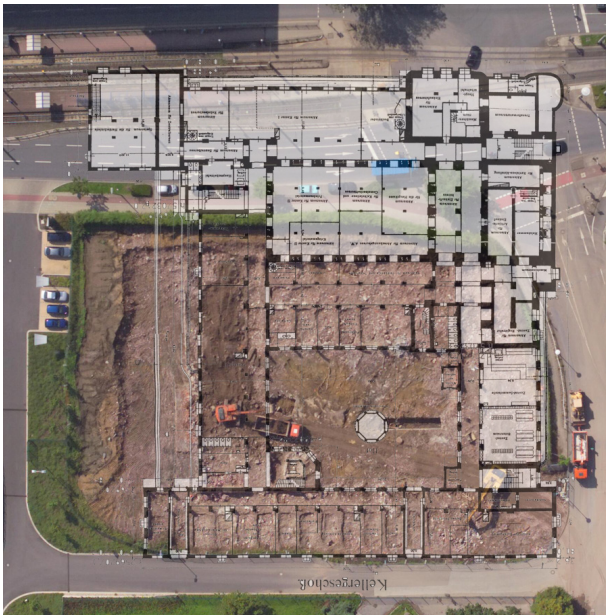
Figure 9. Aerial photograph of cleared basement, combined with archive data

The projects differ in their procedure. The former headquarter of ThyssenKrupp, the so-called “Turmhaus”, was reconstructed from archive documentation without any local measurements. Another object, a forge, was documented by local terrestrial laser scanning with an Imager 5006 by Zoller + Fröhlich and additional photogrammetry measurements. For a global acquisition a series of aerial image measurement was carried out which realise an overview of the huge area.