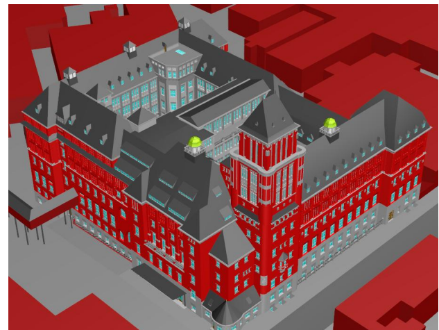
Figure 8. “Turmhaus”: reconstructed from archive data

So for creating a 3-D model no local measurements were possible. The reconstruction was only realised by archive data, i.e. plans and photos. The complete 3-D model was created in Bentley MicroStation and is shown in figure 8.