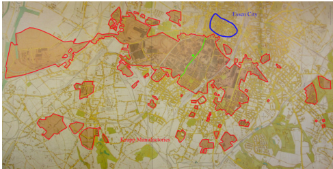
Figure 2. Area of Krupp steel manufactory (1932)