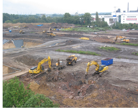
Figure 4. Some diggers in the building site

necessary. An existing net of points had been adjusted to the different terrestrial laser scanning systems and aerial image measurement; some tiepoints were tagged in the area. Because of the dimension of this area additional GPS measurements were sometimes necessary to get the position of the important relicts.