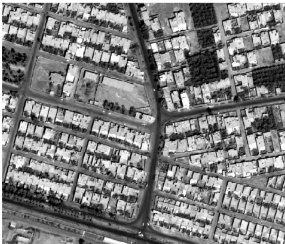
Figure 1. Quick Bird image before Bam earthquake.

Here co-occurrence matrix calculates the texture. The image has acquired by Quick Bird after Bam earthquake is only our data.