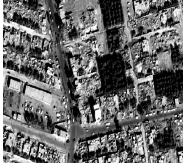
Figure 2. Quick Bird image after Bam earthquake.

Maybe there is not any specific definition about texture, nowadays texture calculation divided to four class and we choose the statistical class and choose the method that is based on co-occurrence matrix which is symmetric in the discussion.