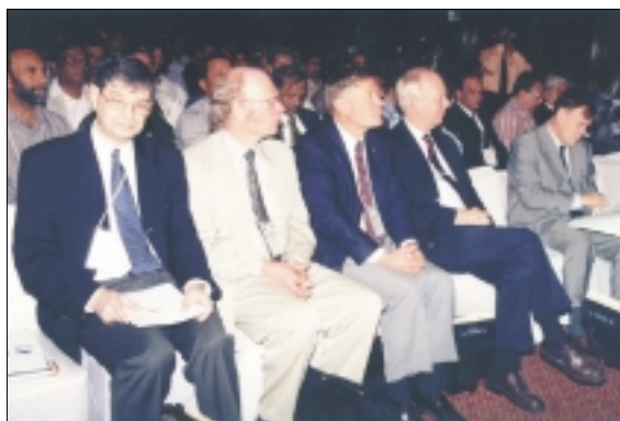
A view of delegates in the symposium gallery.

Each delegate was provided with a soft leather bag containing programme schedule, Abstract volume, Symposium Proceedings on CD-ROM, list of participants, badge, NRSA/Antrix/ISRO publicity material, ISPRS Congress-2004 announcement, travel/tourism brochures, pen and pad. Lunch, coffee/tea, etc. were provided to all delegates.