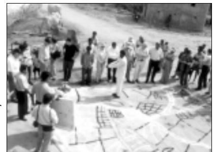
A villager is seen explaining the finer aspects of the watershed to the excursion group.

The NGO representative explained how the program was initiated by adopting Participatory Rural Appraisal techniques in order to build confidence in the local villagers. First a Watershed Association and a committee were formed. Then through education and motivation, village farmers were made aware of the adverse effect of the soil – erosion and drought situation. Villagers were taken into confidence by taking up entry point programs resulting in common welfare of the village community. Continuous motivational training programs were organized. Ample opportunities were given to the watershed committee to prepare its own plan of action for the development of the watershed using inputs available from satellite and other conventional data.