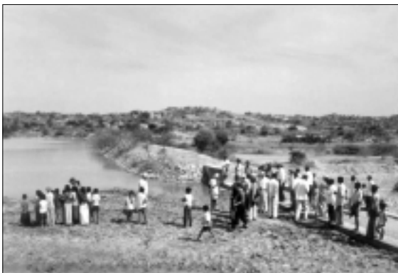
ISPRS group with villagers in the vicinity of the 'Check dam'.

Because barren granitic ridges encircled the village, it was possible to take advantage of the terrain by digging trenches to capture surface runoff and thus recharge the ground water level. This has improved the ground water situation. In many of the bore wells the water level rose from 2 m. to 5 m., whereas in many of the open wells the water level rose on an average of 5 to 12 m. Also a major lineament in the granitic terrain was identified in Sarlapally village, so it was suggested that this would be a good site to construct a check dam. The net result of building