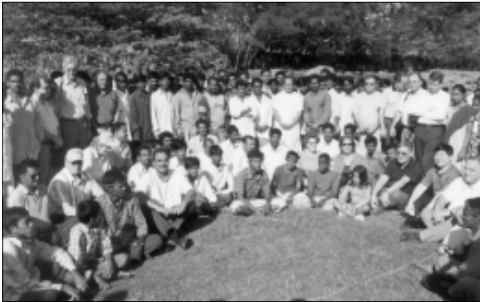
ISPRS group pose with the tribal group of dancers.

Because barren granitic ridges encircled the village, it was possible to take advantage of the terrain by digging trenches to capture surface runoff and thus recharge the ground water level. This has improved the ground water situation. In many of the bore wells the water level rose from 2 m. to 5 m., whereas in many of the open wells the water level rose on an average of 5 to 12 m. Also a major lineament in the granitic terrain was identified in Sarlapally village, so it was suggested that this would be a good site to construct a check dam. The net result of building