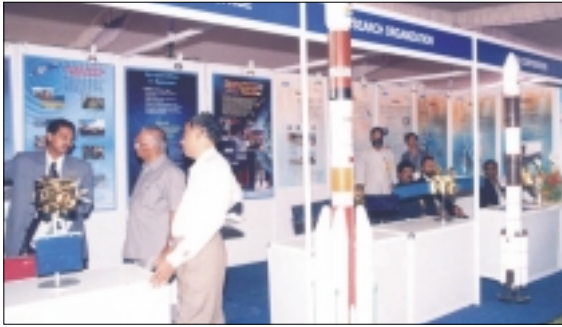
A view of technical exhibition.

abad; Survey of India, Dehradun; CBAS Aerospace, Bangalore; DVP Geomatic Pvt. Ltd., New Delhi; GIS@Development, Noida; Kampsax India (P) Ltd, Gurgaon; Locuz Enterprises, Hyderabad; NIIT – GIS, Hyderabad; N.D. Soft Ecognition; PCI Geomatics, Pune; Rakesh Enterprises, Hyderabad; Remote Sensing Instruments, Hyderabad (2); Rolta India, Mumbai; Sierra Atlantic, Hyderabad; Silicon Graphics India, New Delhi; Sinsil International, Vadodara and Speck Systems Pvt. Ltd. Hyderabad