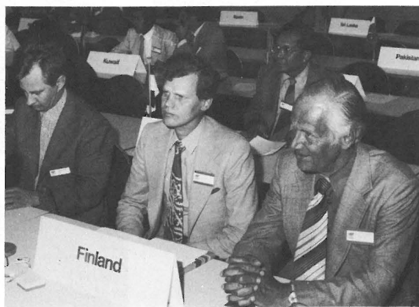
Delegates at the General Assembly