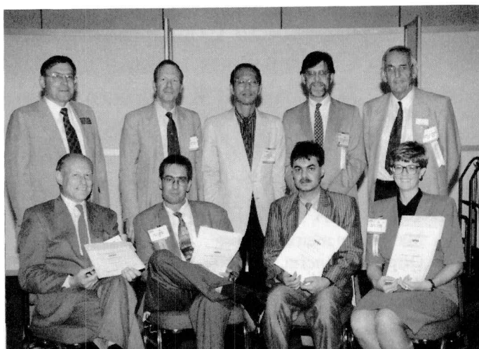
Sustaining Members With Certificates of Appreciation

Shin Gijutsu Consultant Co., Ltd. Tokyo Branch Manager 988, Bessho, Hachioji-City Tokyo 192-03 Japan