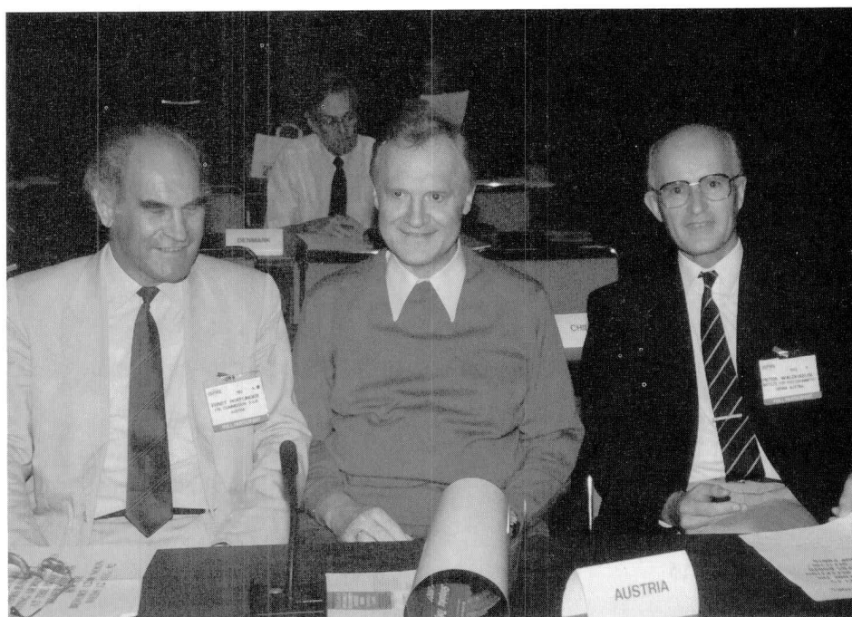
The Austrian Delegates - Winners of the 1996 Congress