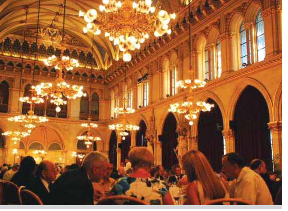
On 4 July, a gala dinner was arranged for the guests at the Festsaal of the City Hall of Vienna