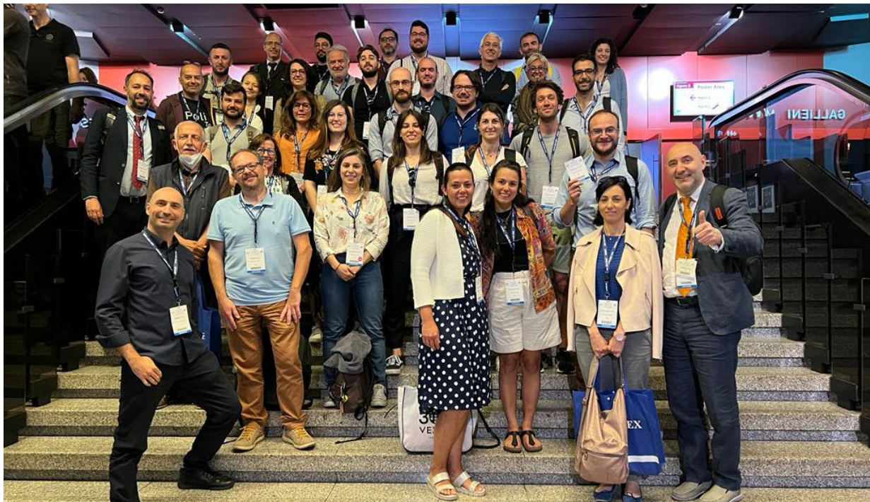
Group photo of Italian researchers from different universities