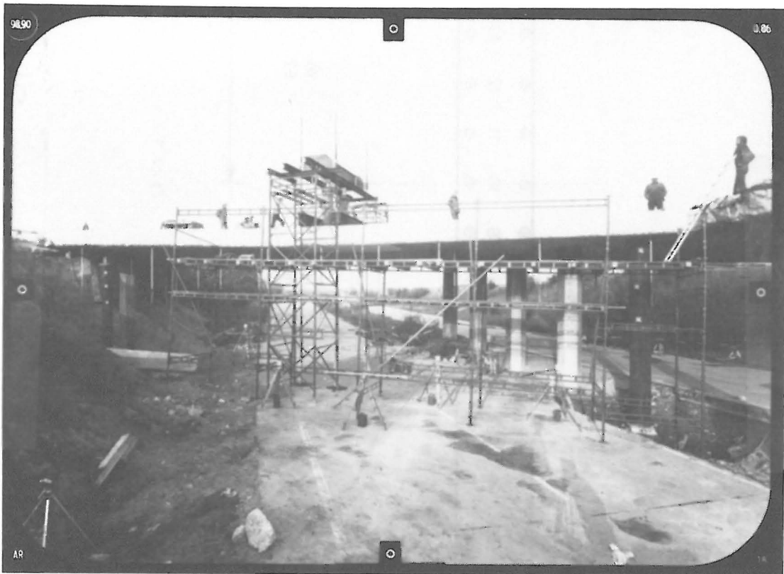
The bridge just before failure

Two UMK/10 cameras were used, the left-side camera with rolling film and the right-side camera with glass plates. Both cameras were placed on supports three meters above road level and at a distance of fourteen meters from the bridge facade. The distance between the cameras was 4.5 meters. Five control points were determined by intersection. The arrangement of control points and cameras is shown in Figures 1 and 2. Due to poor exposure condition, point No. 64 was omitted. In order to establish the scale, the two points, 98 and 99, of a substance bar were furthermore intersected. Those two points were also used as control points at the absolute orientation of the stereo model. The measure-points were placed in the upper and lower sides, respectively, of the bridge in vertical sections at a distance of approximately one meter. Furthermore, a few points were placed on the two columns, see Figure 1.