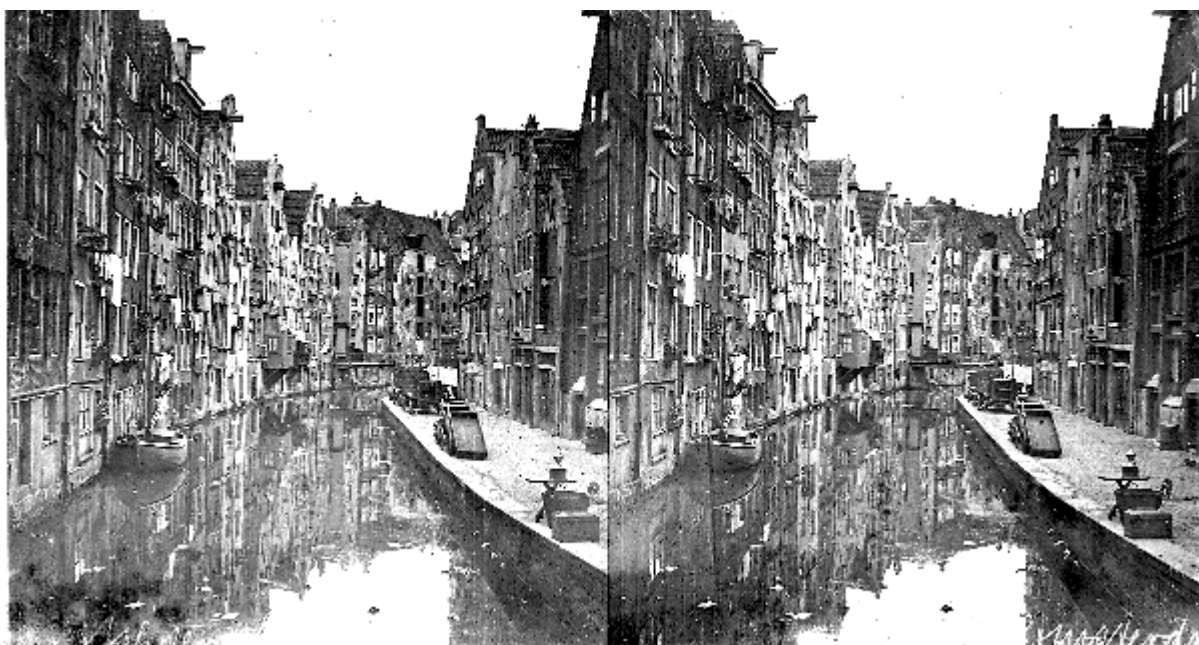
Figure 2. As a sample and as homage to the host of the ISPRS 2000 congress a rare stereo pair of old Amsterdam is shown showing one sample of estimated existing 1 million existing unique classical stereo mates.