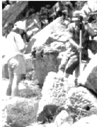
Figure 3. Video based Monument Tachymetry, as here applied in PATARA (Turkey), a state of the art method, to replace time consuming sketches and signals for geometric purposes.

As another important experience from practical applications of basic Photogrammetry, videoclips successfully have been used, to replace sketches and signals for controlpoints! This method has been applied for photogrammetric mapping of the ruins of Europe' s largest antique houses of parliaments in Patara (Turkey), even a candidate for Atlantis, see figure 3: