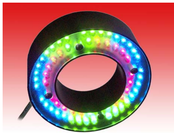
Figure 2. Ring light LED light source

The use of LEDs in the DSW allows especially for a much more efficient implementation of sequential color capture than has been used in the past. It is faster. Previous models all employed a rotating colour wheel with red, green and blue optical filters to make the colour separation while the scanner stood stationary at a given location in the film. This capture process was slow since it was a mechanical device that re-