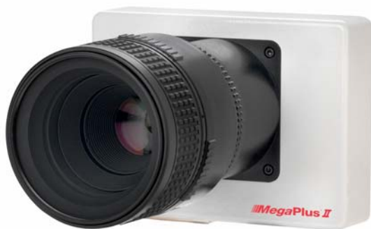
Figure 3. Redlake ES11000 11-megapixel sensor

The third of the key technologies improved in the new model is the sensor itself. Faster and larger sensors that are also lower in noise translate directly into speed and quality improvements. The DSW uses area sensors, created or influenced by the digital photographic camera industry. The current developments in this field have emphasized 35 mm film format equivalency, of which state of the art is about 11 megapixels, causing a 9\ \mu\text{m} sensor pitch. To accommodate high speed photography, the readout rates have been greatly improved over the cameras of five years ago. The standard computer PCI bus is now becoming the bottleneck and we look forward to the next generation PCI Xpress bus. The Redlake ES11000 11-megapixel camera tested for the DSW700 is illustrated in figure 3.