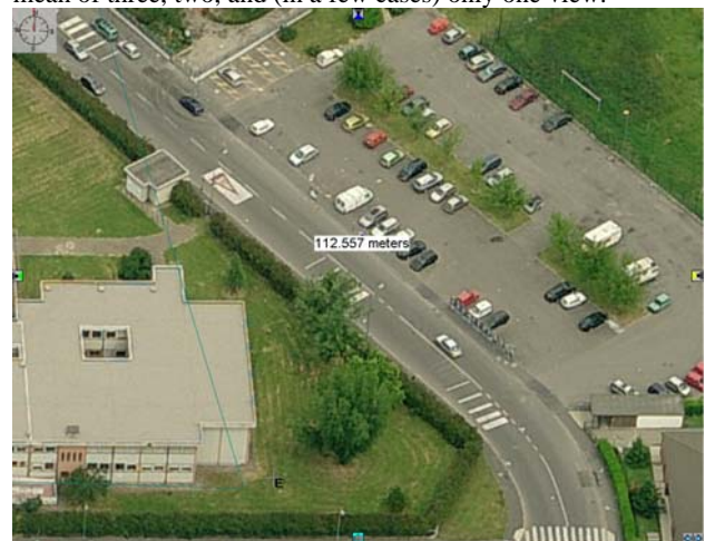
Figure 4. Direct measure of point elevation in oblique images realized in Pictometry EFS system

We measured the x, y and z coordinates of these checkpoints (fig.4) on each of the 4-view Pictometry images, where visible, to compute errors in Eastings, Northings, and Elevations. For each checkpoint, we also averaged the Eastings, Northings and elevations for all views that were visible; for many, the average resulted from four views, but some points were obscured by buildings, trees, cars, etc., so the average resulted from the mean of three, two, and (in a few cases) only one view.