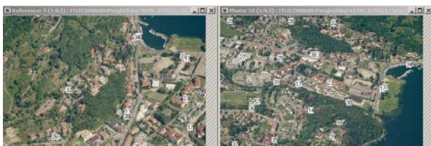
Figure 5. Oblique Image collected tie point, image are 90 degree direction (S-E) staggered. The interpretation of the images and the recognition of homologues point is not simple

For the registration process we use Photomodeler software, that allows to orient the images with any orientation. The process is time-cost and is not simple due to the particular geometry of the pictures.