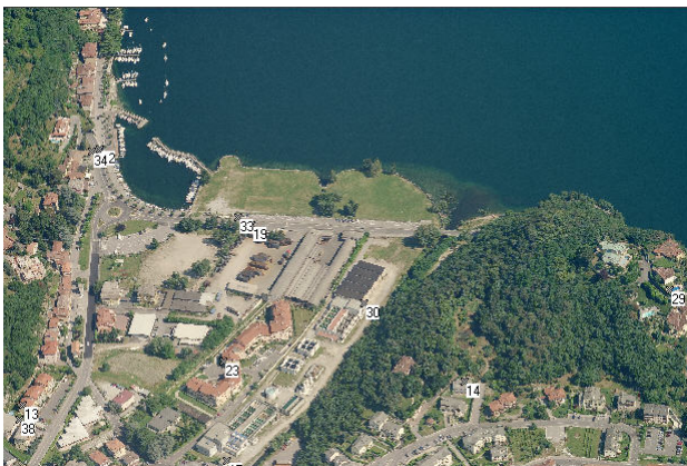
Figure 3. Oblique images of Lecco Lake

Some of this data was already used in other research about the 3D city model and the generation of 3D object for GIS, in the previous studies (Brumana, 2006) was emerged that the 3D digital map is not enough to completely define the 3D model of complex scene such as urban areas. It is necessary to use some additional data these can be aerial images, high resolution DSM and also oblique images.