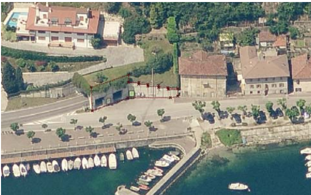
Figure 7. Manual Feature extraction, a vertical wall

the walls all that elements which have a big vertical development.