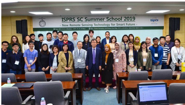
Attendees of 2019 Korea Summer School sponsored by TIF