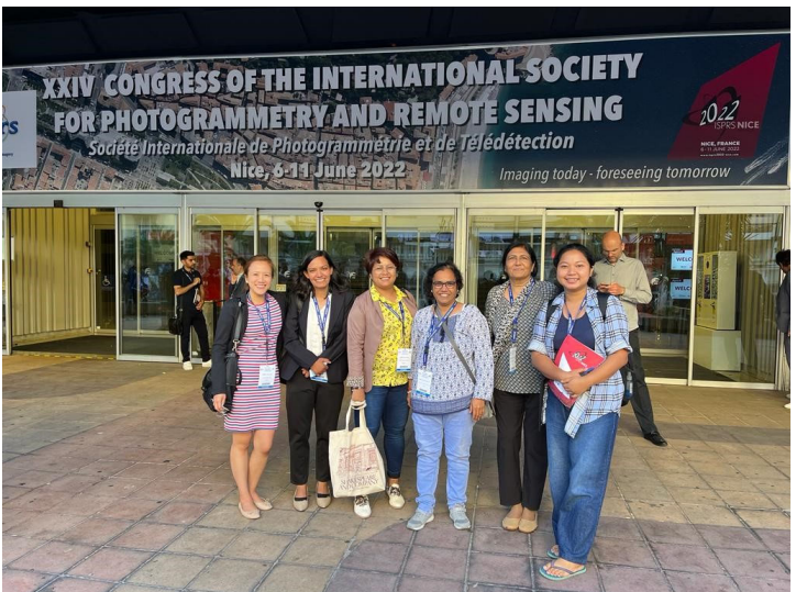
2022 ISPRS Nice Congress Student Consortium members and participants