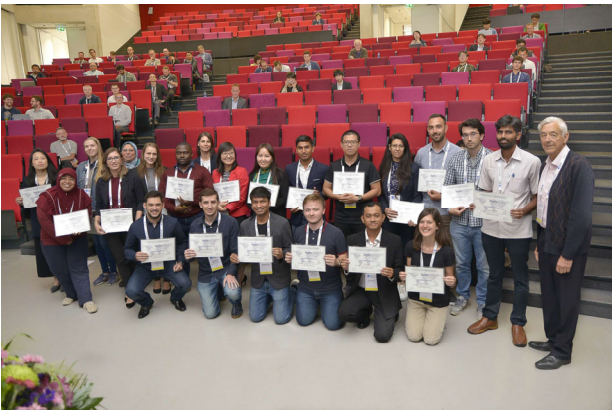
2019 The Netherlands Geospatial Week awardees of TIF Travel Grant

ISPRS Council annually assesses needs and submits requests for support to TIF. Based on availability of funds, TIF Trustees assess the merits of the requests and are the approval authority. Multinational committees (no more than two committee members may be of the same nationality) support the Trustees in evaluating the requests.