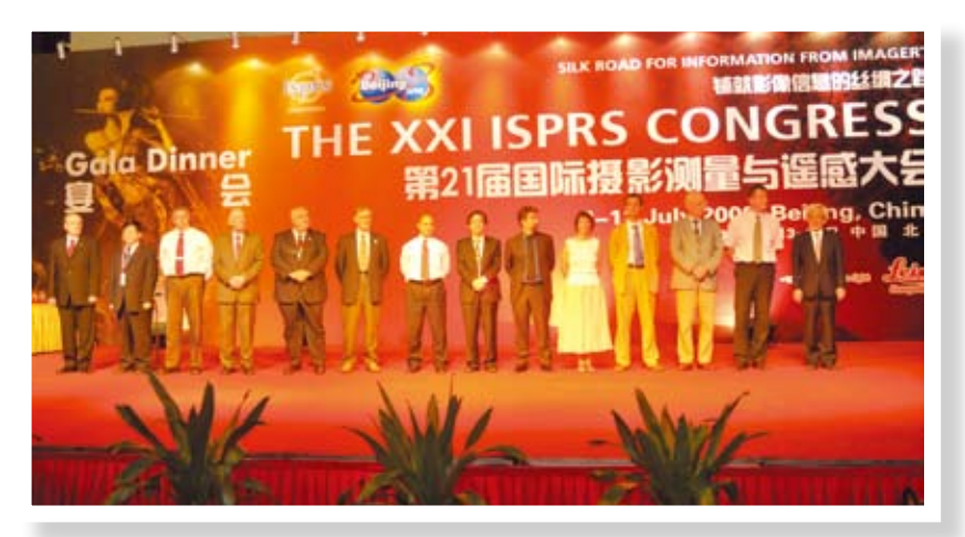
The Incoming ISPRS Council Members & Technical Commission Presidents