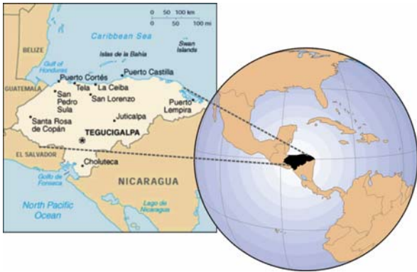
Figure 1. Location of the study area Tegucigalpa in Honduras.