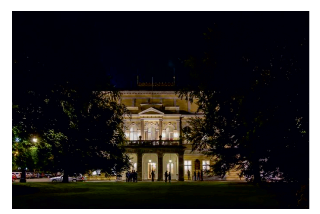
Žofín after the Gala Dinner