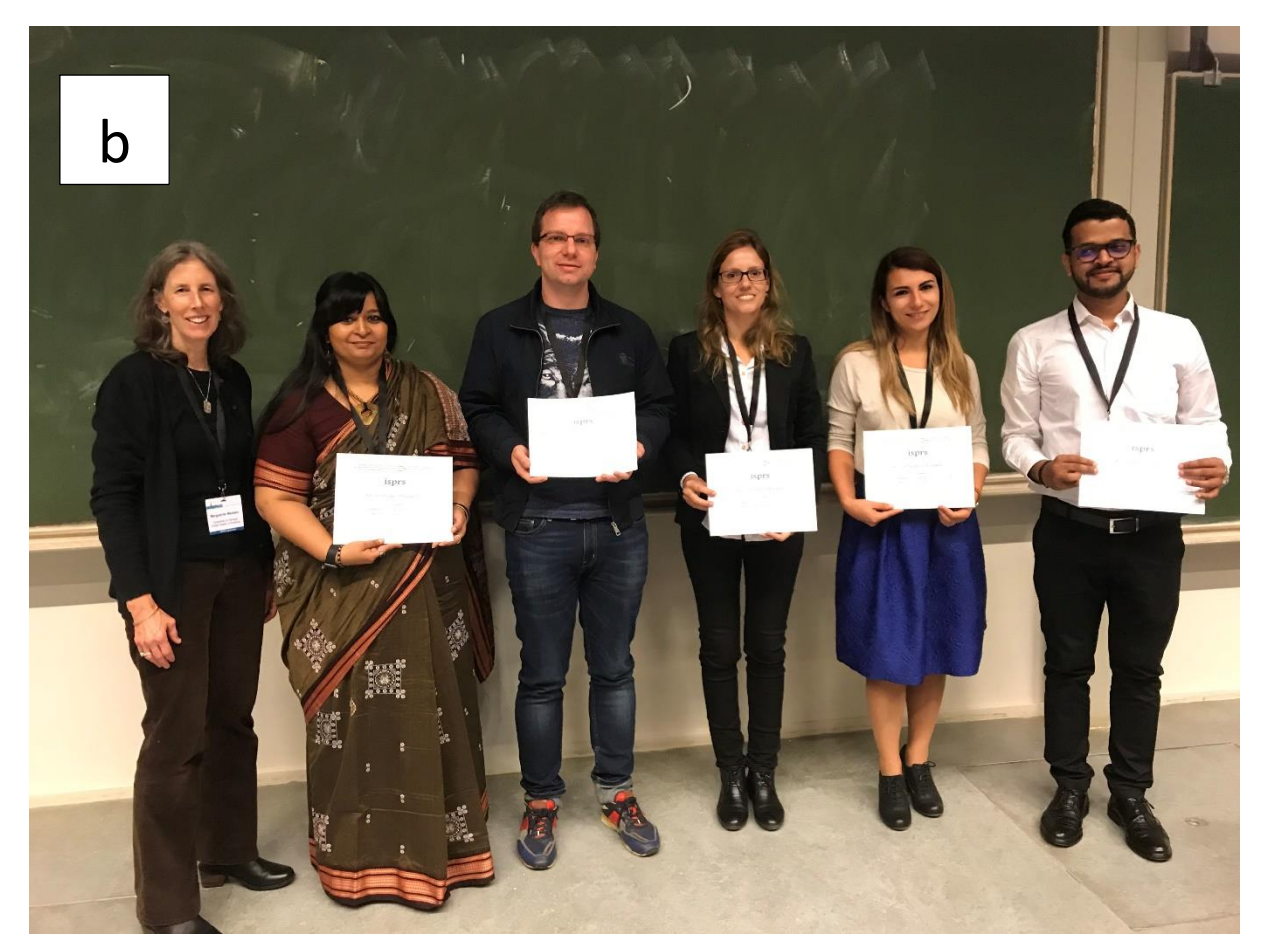
Figure 1. TIF Travel Grant recipients at the: a) Technical Commission I Symposium held in 2018 in Karlsruhe, Germany; and b) Technical Commission IV Symposium held in 2018 in Delft, The Netherlands.