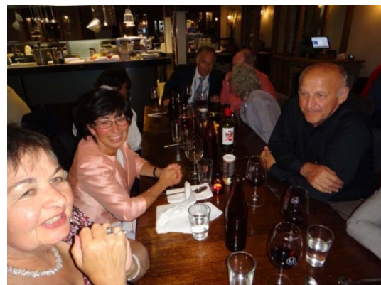
Scenes from the TIF Fundraising Dinner