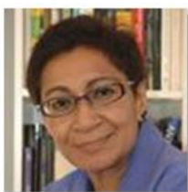
Dr. Mazlan Othman

ISPRS Treasurer School of Civil Engineering and Geosciences Newcastle University, UK