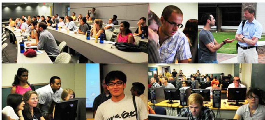
The primary aim of The ISPRS Foundation (TIF) is to support Young Researchers

The ISPRS Foundation programs benefit the international community by enabling improved education, training and tools to be shared with the less privileged, especially those in emerging markets and regions. In addition to recognizing and rewarding outstanding candidates and achievements, The Foundation promotes and facilitates international cooperation and collaboration by supporting research initiatives for advancing the capabilities and beneficial applications of the sciences, technologies and disciplines of the photogrammetry, remote sensing and spatial information sciences.