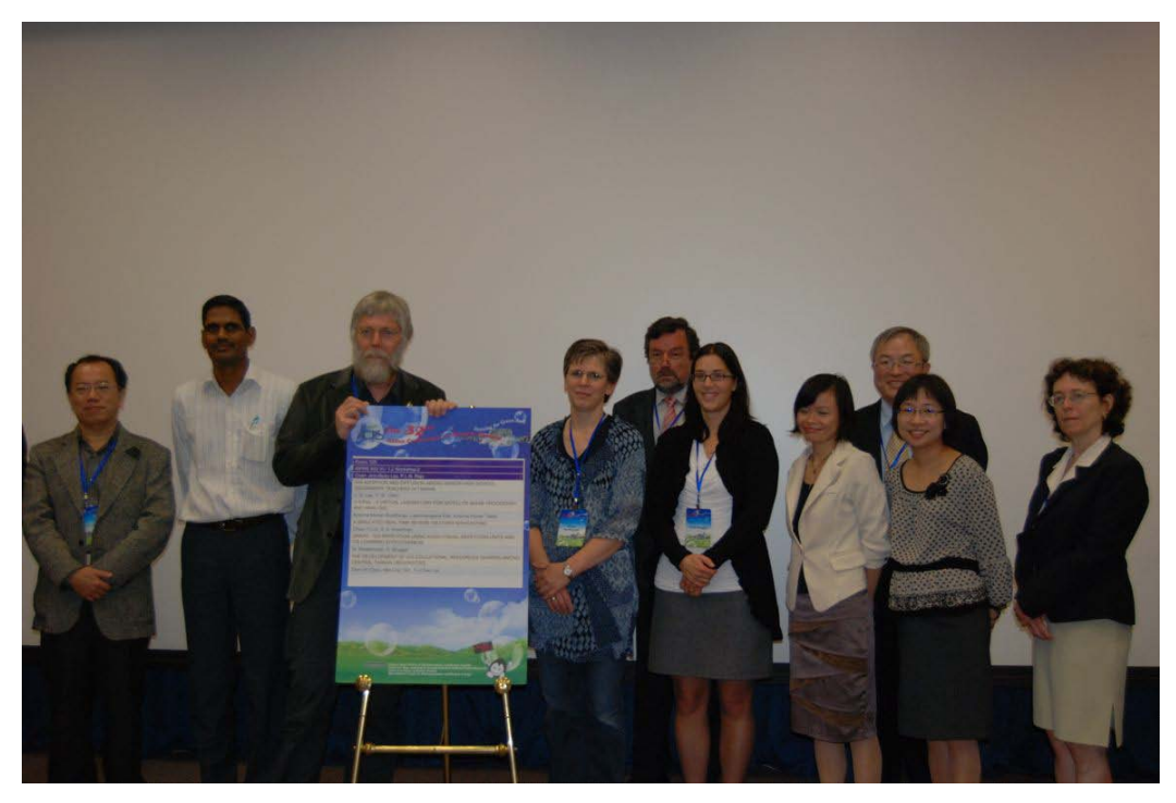
Photo 2, Group Picture of Speakers and Distinguished Guests after Session 2