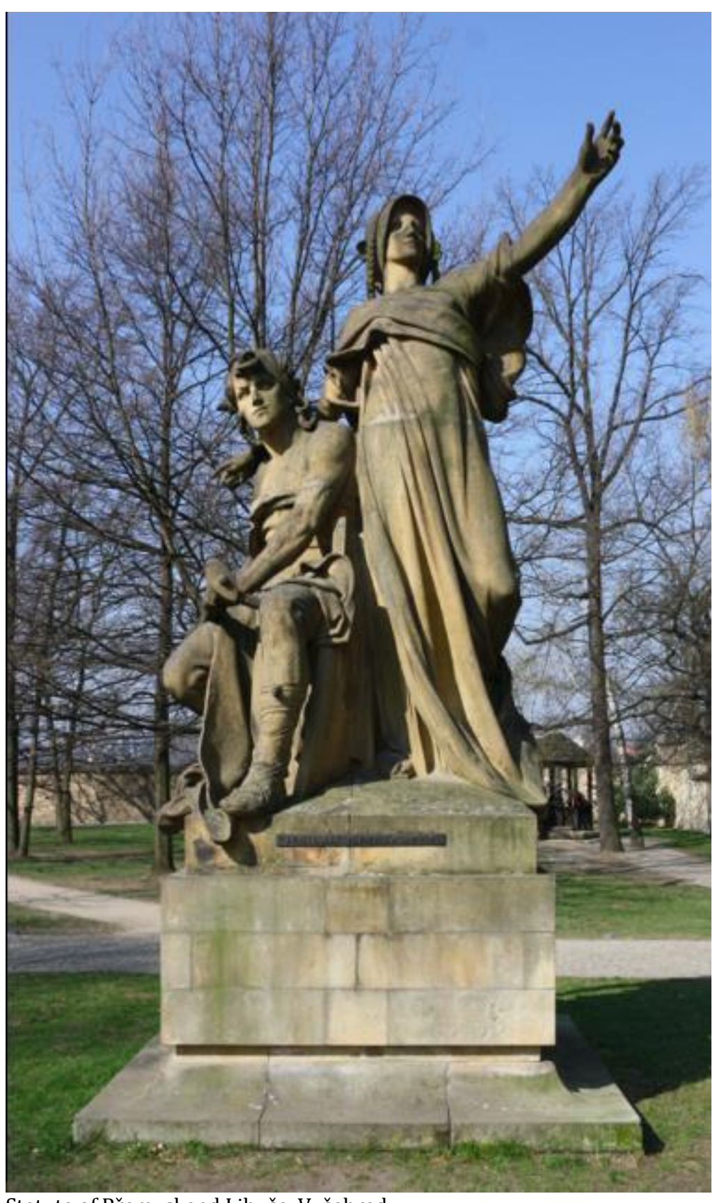
Statute of Přemysl and Libuše, Vyšehrad (http://cs.wikipedia.org/wiki/Soubor:Praha,_Vyšehrad,_Přemysl_a_Libuše_(201 2).JPG)