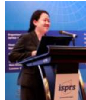
Opening ceremony of the symposium