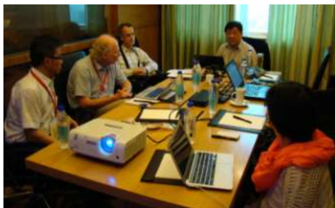
ISPRS Council meeting

Technical exhibitions were organized during the symposium. Eight exhibitors attend the exhibition, including GIS software, graphic workstation, image processing platform, unmanned aircraft system, web maps etc. Chinese computer-maker Lenovo Group, as the most typical one of them, brought four-screen solution for data processing which generated lots of attention from users intrigued by features like price and efficient performance. The on-line geographic information service platform MapWorld (Tianditu), developed by National Administration of Surveying, Mapping and Geoinformation of China (NASG), also drew lots of attention.