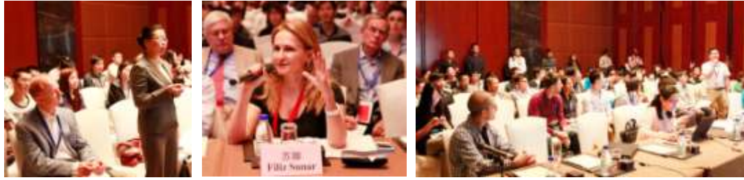
Oral Technical Sessions