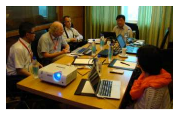
ISPRS Council meeting

Technical exhibitions were organized during the symposium. Eight exhibitors attend the exhibition, including GIS software, graphic workstation, image processing platform, unmanned aircraft system, web maps etc. Chinese computer-maker Lenovo Group, as the most typical one of them, brought four-screen solution for data processing which generated lots of attention from users intrigued by features like price and efficient performance. The on-line geographic information service platform MapWorld (Tianditu), developed by National Administration of Surveying, Mapping and Geoinformation of China (NASG), also drew lots of attention.