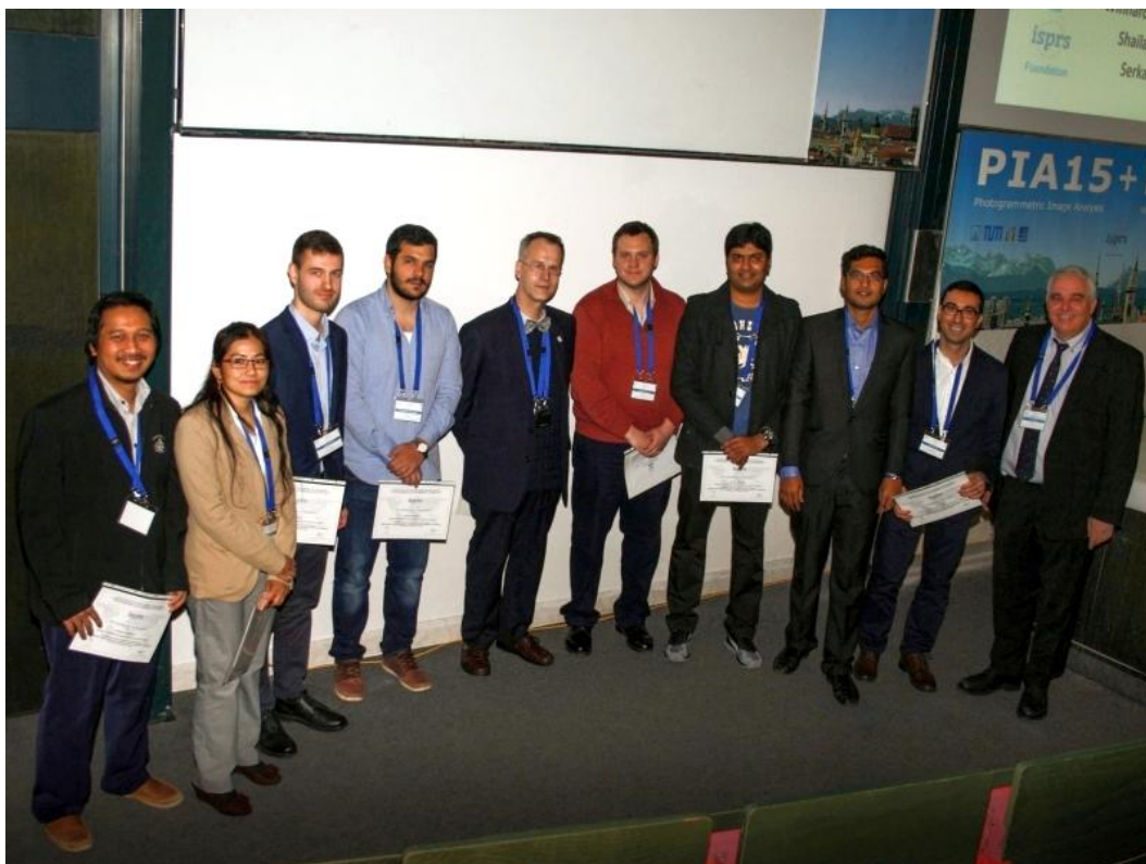
Figure 1: ISPRS Foundation Travel Grantees

It was such a great opportunity for me to visit Munich for the first time in my life. The paper submitted by me and my postgraduate thesis supervisor was entitled "Comparative assessment of very high resolution satellite and aerial orthoimagery" and its main aim was to assess the accuracy and radiometric quality of orthorectified high resolution satellite imagery from Pleiades-1B satellites through a comparative evaluation of their quantitative and qualitative properties.