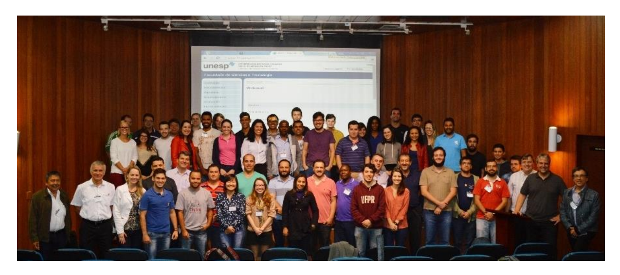
Figure 1: Group photo

The event had a total of 78 registrations (see group photo in Fig.1), mostly students (approx. 85%) and researchers (approx. 13%) from 8 Brazilian universities. It is worth mentioning that 6 students from outside Curitiba received a grant from the organizing committee to cover accommodation costs.