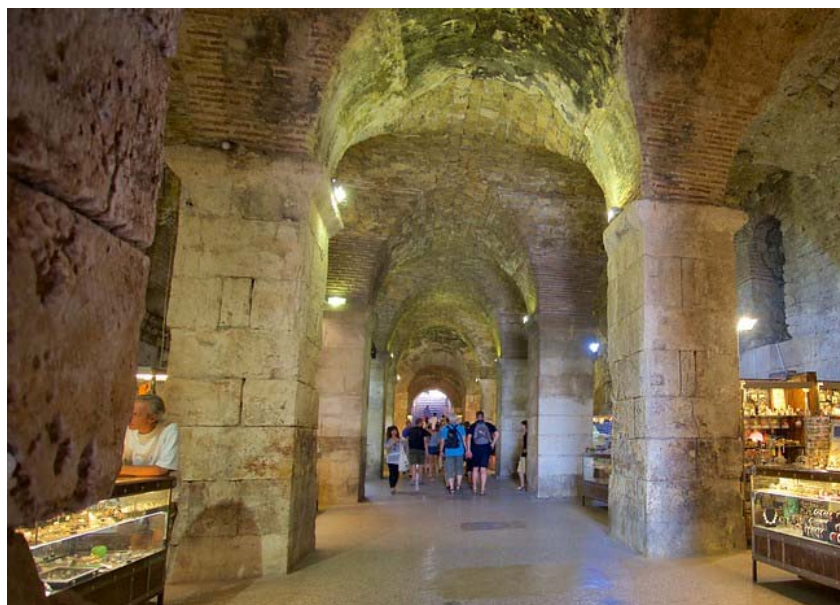
Tour through the substructures of the Diocletian's Palace