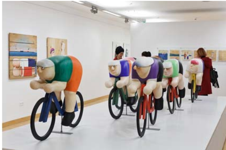
Reception and welcome drink in the University Gallery "Vasko Lipovac"