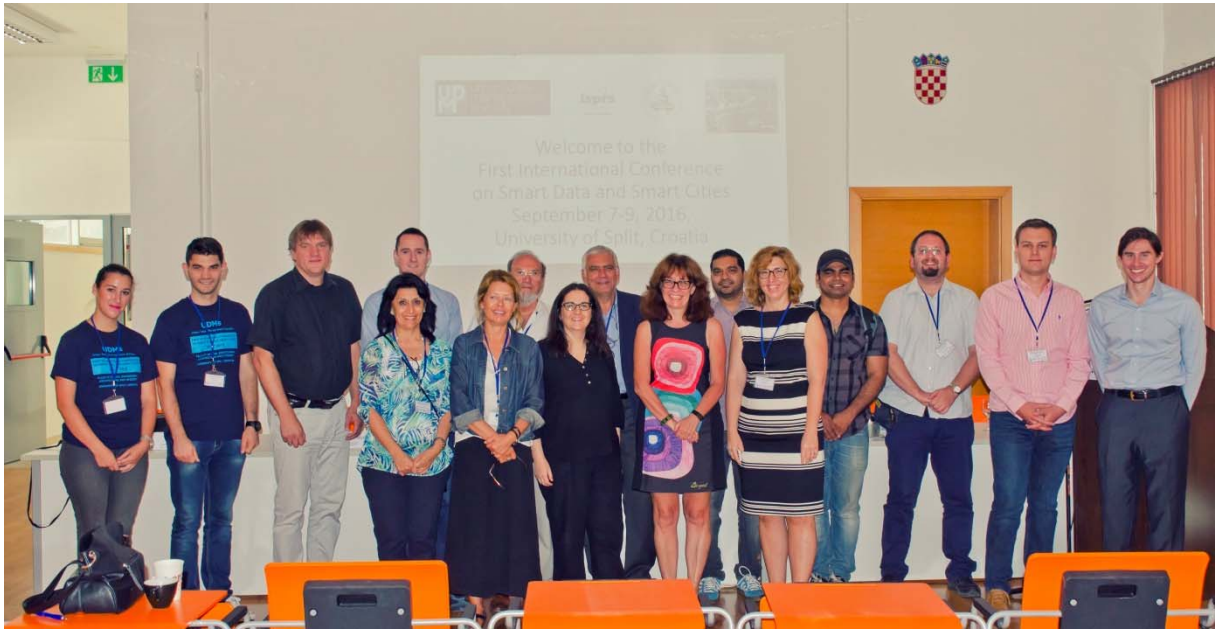
International and local organising committee