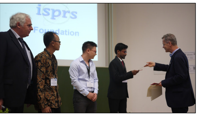
Receiving The ISPRS Foundation Travel Grant Certificate