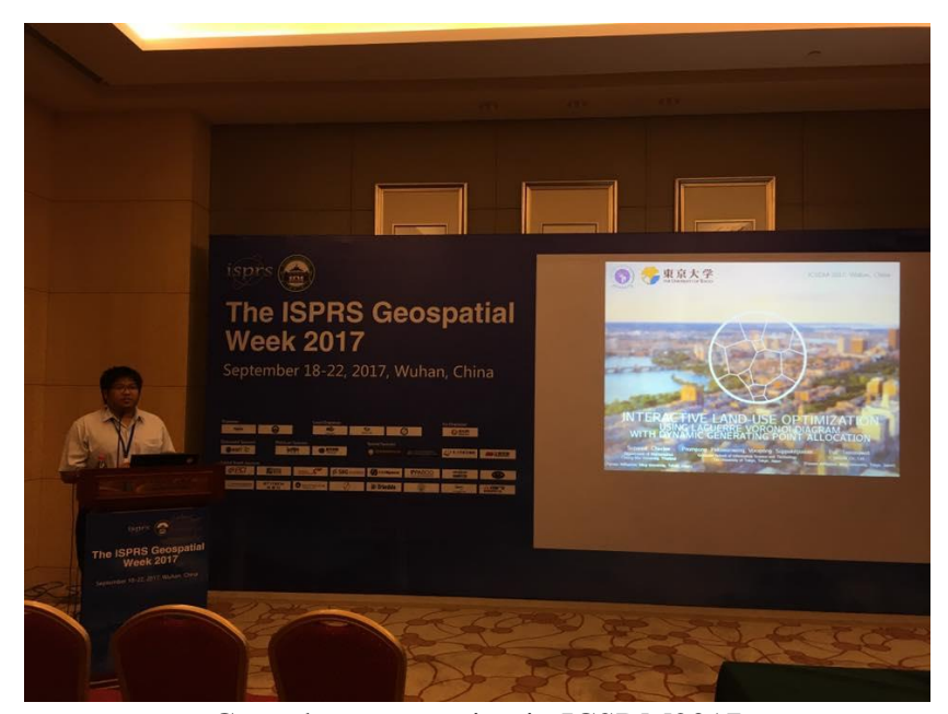
Gave the presentation in ICSDM2017