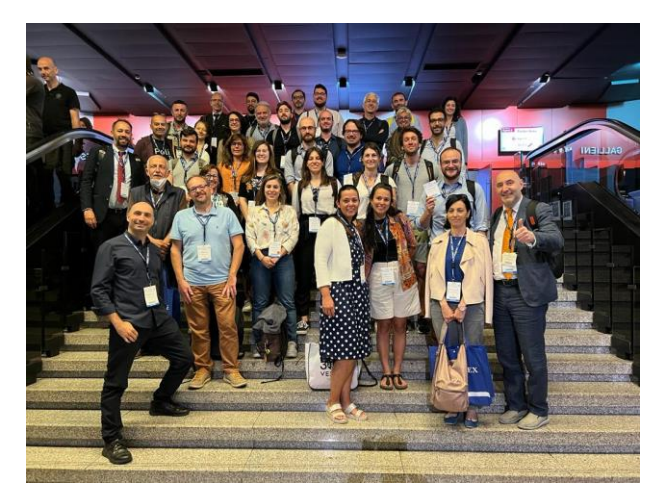
During the Congress, I also promoted the SUNRISE Summer School I'm organising with Politecnico of Turin and promoted by the ISPRS SS consortium.