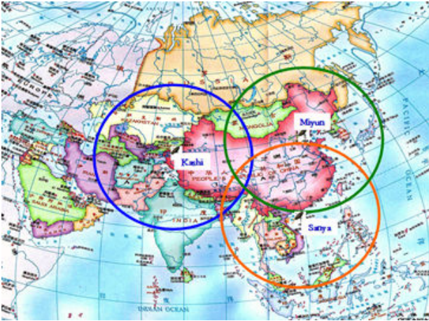
Figure1. The RSGS remote sensing data receiving area.