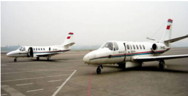
Figure2. The remote sensing aircraft of CAS

The airborne platform in SAG is the Remote Sensing Aircraft in Chinese Academy of Science (CAS). In 1986, CAS imported two advanced and high performance U.S. Cessna "certificate of merit S / II-type" high-altitude aircraft and began its formal operation. The remote sensing aircrafts were key scientific equipment for remote sensing sensors independently developed by the Chinese Academy of Sciences for airborne remote sensing information acquisition and processing. The remote sensing aircrafts are equipped with precise GPS navigation, POS, optical sensors, SAR sensors, Lidar sensors and other systems, and have all weather and days and nights working ability.