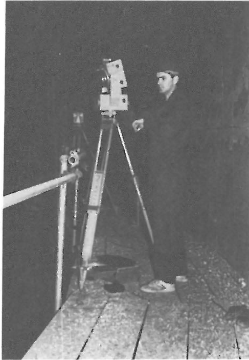
Fig. 3: Photograph taken with the UMK 10/1318.