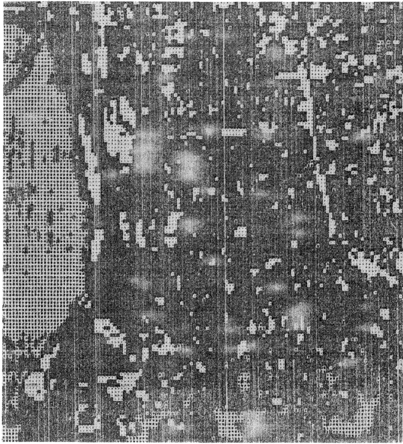
Figure 2 a - Segmented image: band 1.