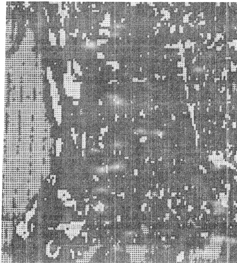
Figure 2 b - Segmented image: band 2 .