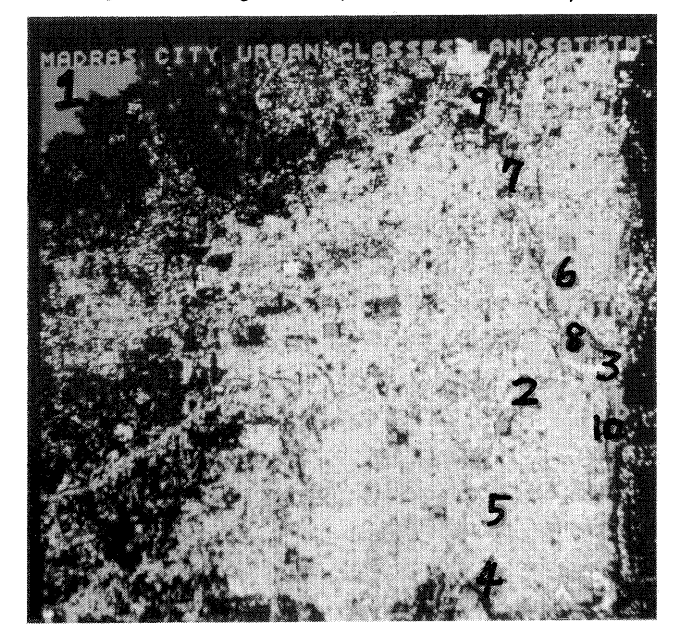
Fig.3 Original(MADRAS CITY)