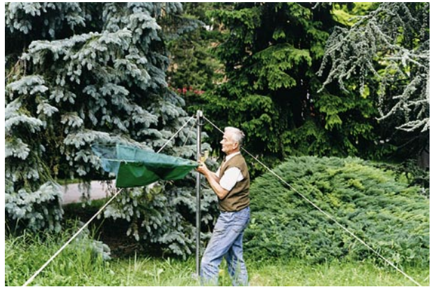
Photo 4 For safety reasons the capsule is caught in a net