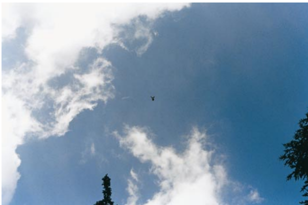
Photo 3 Capsule on its way back to the ground following the launching and taking of photographs