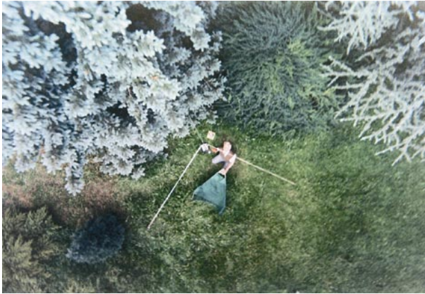
Photo 7 Parts of the trees of three different species photographed 15 m above the ground