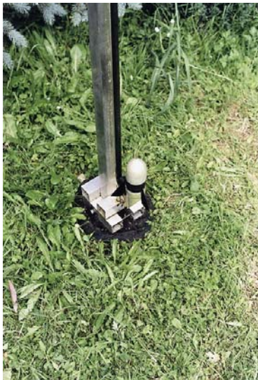
Photo 2 Detail of the bottom of the launching pad with the mounted capsule