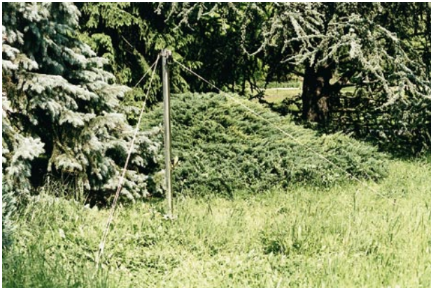
Photo 1 Launching pad fixed to the ground by means of three stakes and three strings