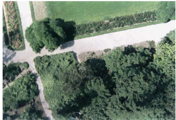
Photo 5 Detail of the central part of the Botanical Gardens in Zagreb, photographed 30 m above ground