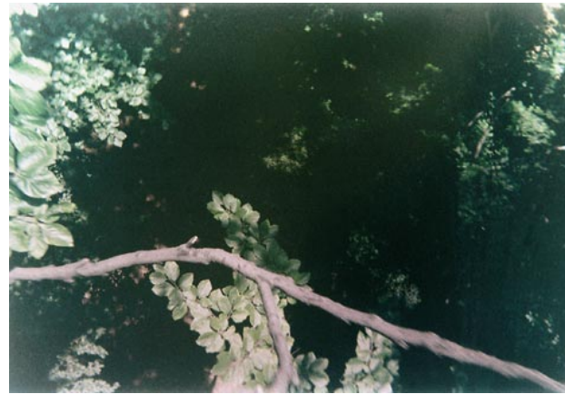
Photo 10 Detail of part of a Beech tree crown ( Fagus sylvatica L.) at a height of 27 m.