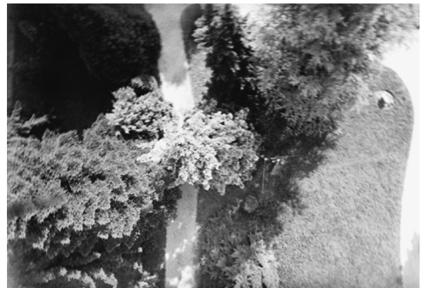
Photo 6 Forest trees, various species