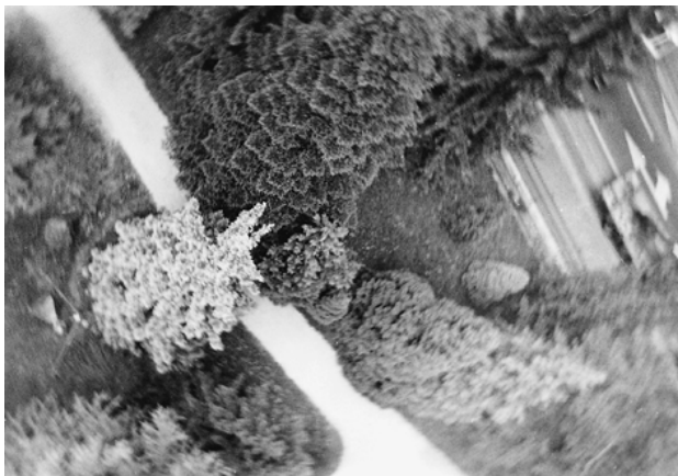
Photo 8 Detail of the northern part of the Botanical Gardens in which, apart from the trees, street traffic is also visible